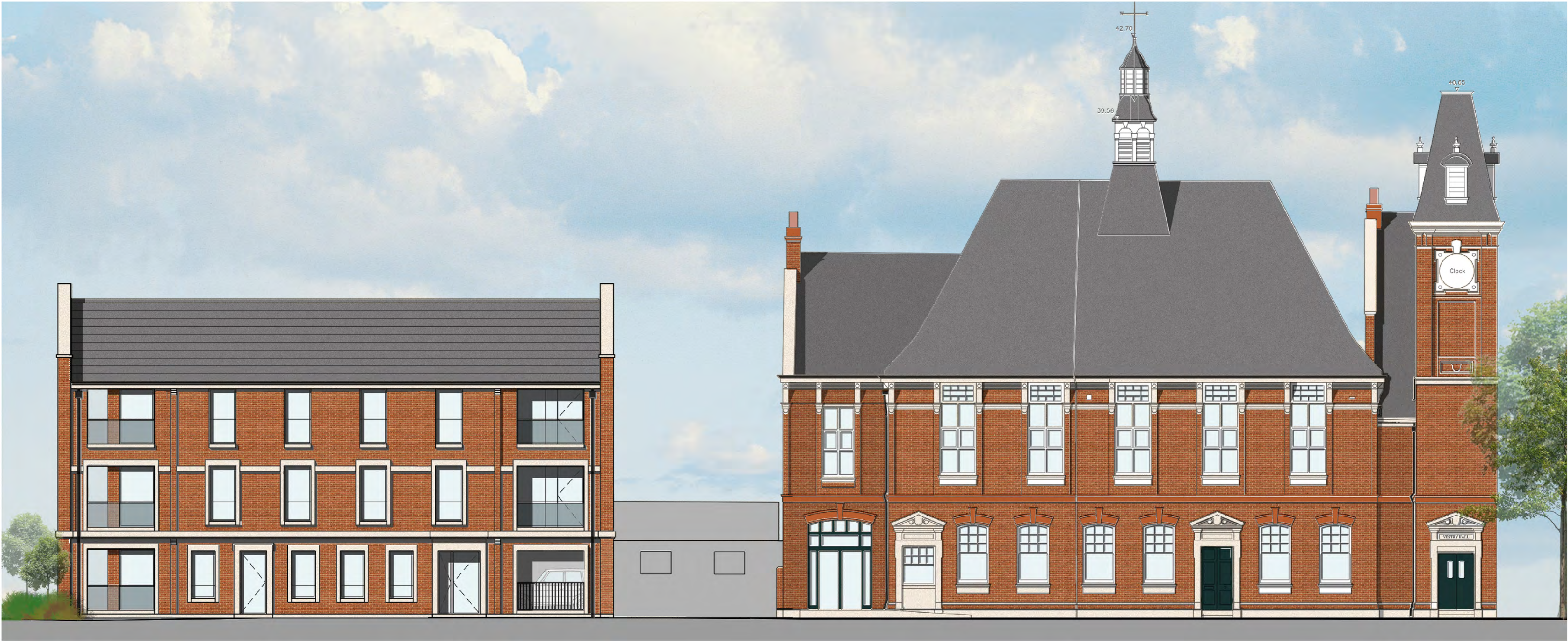
London Road Elevation 1:100

Notes: Do not scale from this drawing. All contractors must visit the site and be responsible for taking and checking Dimensions. All construction information should be taken from figured dimensions only. Any discrepancies between drawings, specifications and site conditions must be brought to the attention of the supervising officer. This drawing & the works depicted are the copyright of John Thompson & Partners. This drawing is for planning purposes only, it is not intended to be used for construction purposes, whilst all reasonable efforts are used to ensure drawings are accurate, John Thompson & Partners accept no responsibility or liability for any reliance placed on, or use made of, this plan by anyone for purposes other than those stated above.