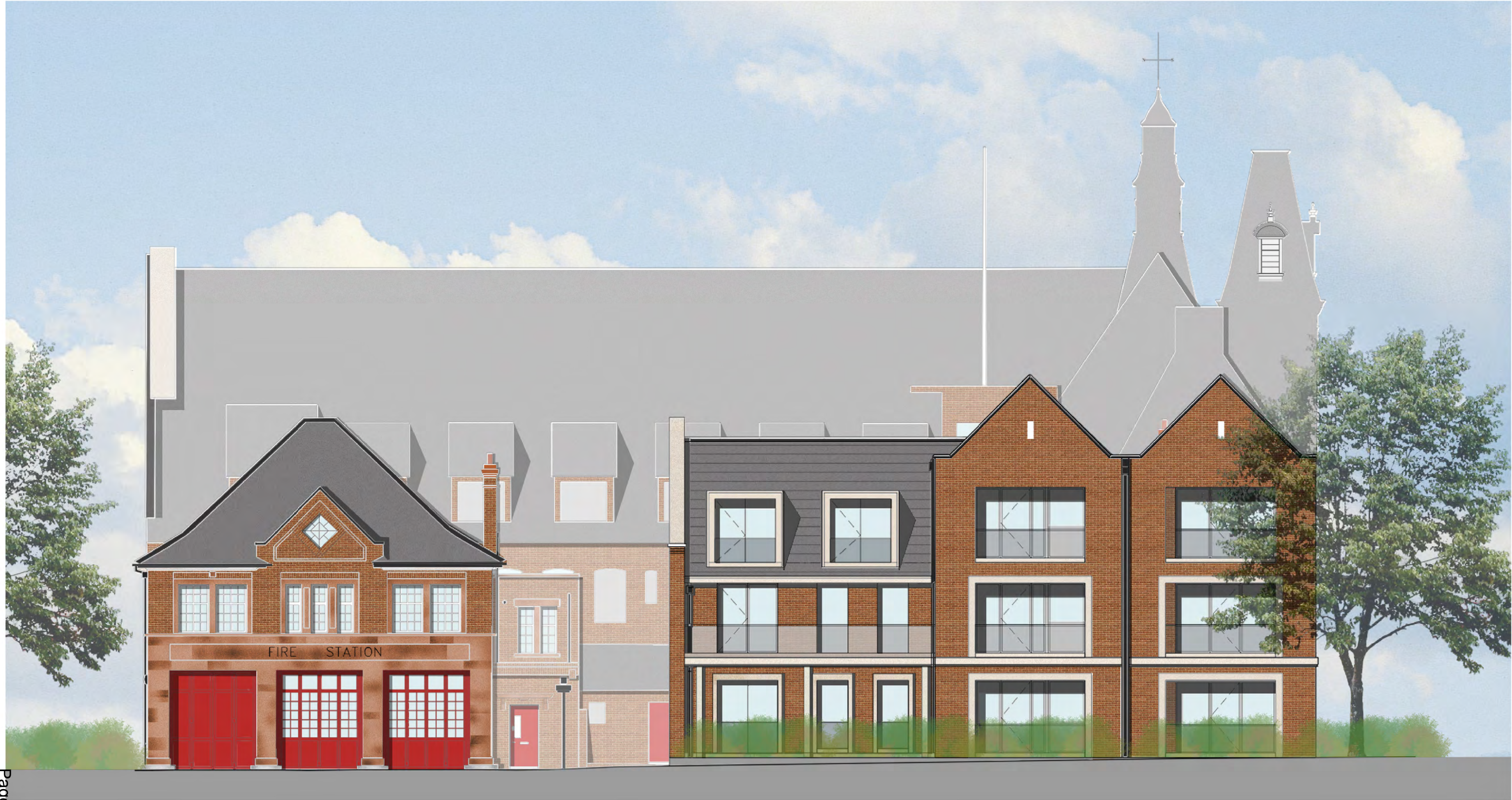
Lower Green West Elevation 1:100